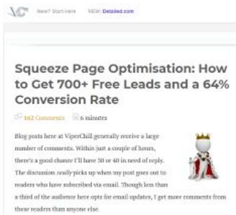
The Blog Post / Article