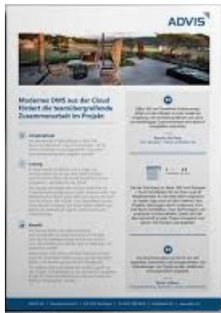
The PDF Download